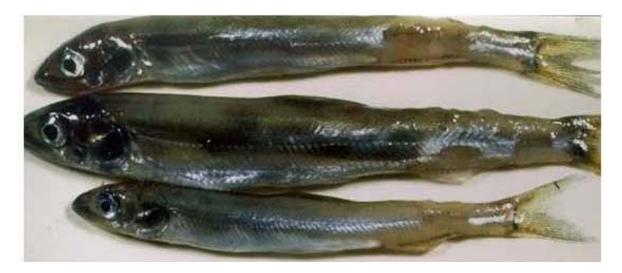
Figure 5.3. Peduncle lesions caused by F. psychrophilum in juvenile ayu.

The clinical signs of ayu infected with F. psychrophilum are similar to those of salmonid species. Skin and muscle peduncle lesions are observed first in juvenile ayu (Figure 5.3). In epizootics of BCWD among feral adult ayu, deep dermal ulcerations with necrosis of underlying musculature are found at various locations on the lateral side (Figure 5.4). Most of the affected feral ayu show pale gills, liver discoloration, and spleen hypertrophy (Iida and Mizokami, 1996).