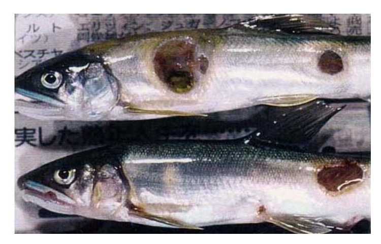
Figure 5.4. Deep dermal ulceration with necrosis of the underlying musculature caused by F. psychrophilum in feral adult ayu