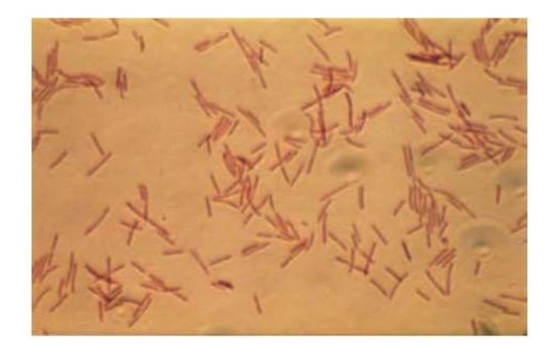
Figure 5.2. Gram-stained F. prychrophilum cells, measuring 0.5 \times 2 - 7 \mu m .

content) were reported 33.2-35.3 mol% with a mean of 34.3% for 13 strains (Holt et al. 1993), and 32.5-33.8mol% with a mean of 33.4% for 3 strains (Bernardet and Kerouault 1989). Duchaud et al. (2007) reported the complete genome sequence of the virulent strain JIP02/86 (ATCC49511) of F. psychrophilum that contained 32.54% G+C content.